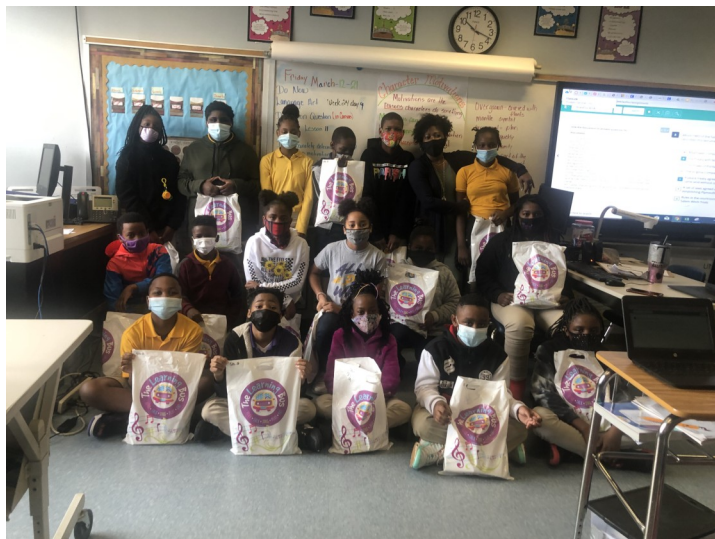
(Above right) Just one of the classrooms who received the bags.